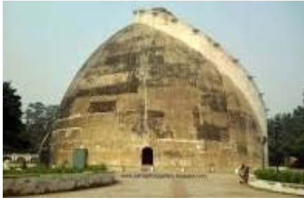
Golghar at Patna